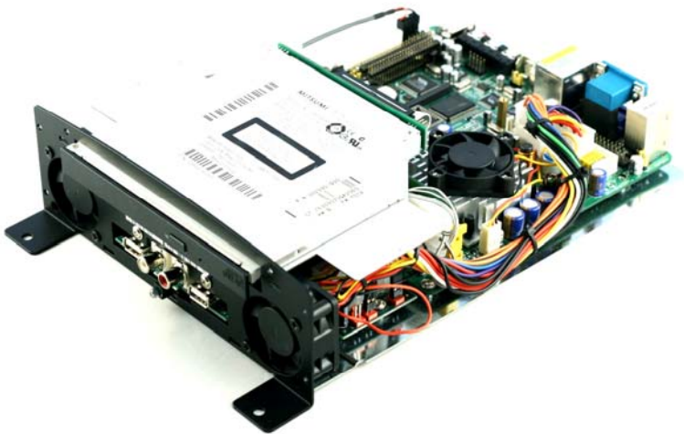
Figure 1.1, bottom mounting plate