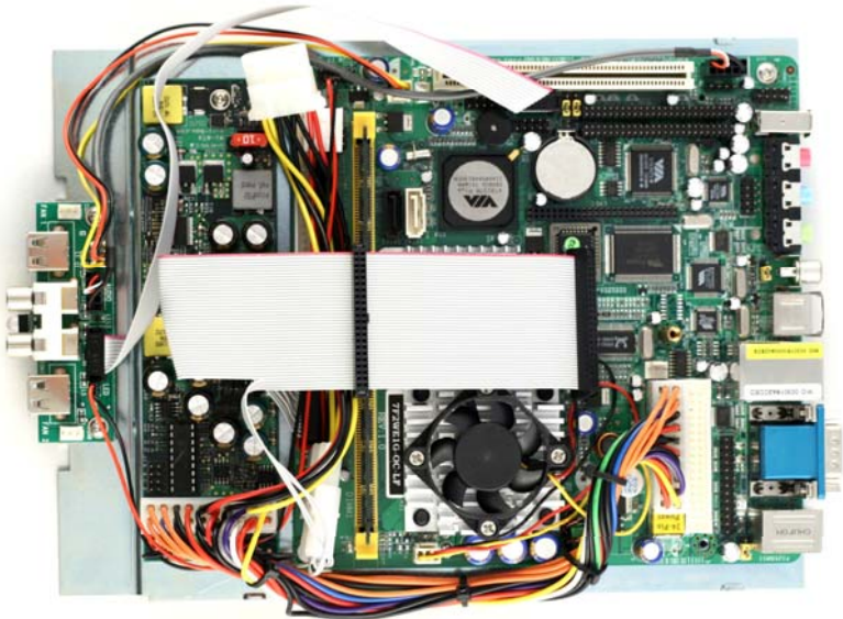
Figure 1.0, bottom mounting plate

In order to install the VoomPC-2 in your vehicle you will need the following: -Phillips screwdriver and Wire cutter / stripper -Few feet of wire (AWG 12-16), preferably color coded, used for power input.